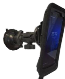
Passive vehicle mounting with arm and suction cup compatible with the Pouch PN: 13F280006-2