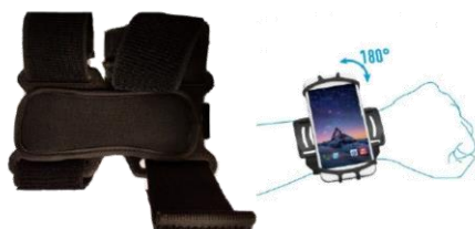
Compatible wrist attachment system PN: 13F280005