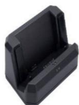
Single Charging Station PN: 13F280001