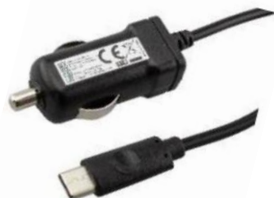
Standard cigarette lighter USB charging cord 12/24V PN: 13F280007