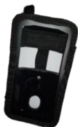
Pouch with quick coupling system PN: 13F280003