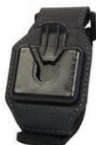
Clip Belt attachment PN: 13F280004