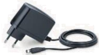
Pump Express adapter chargerPN: 13F280008