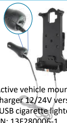
Active vehicle mounting and charger 12/24V version "USB cigarette lighter" PN: 13F280006-1